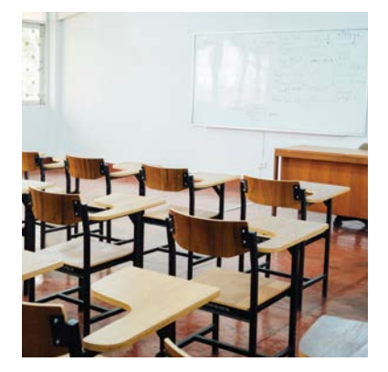
HOUSING & EDUCATION