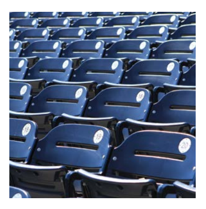
ARENAS & ATHLETIC FACILITIES