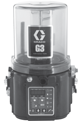
G3 Max Model