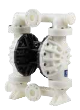
Husky 2200 2 in (50.8 mm) connection Max flow: 200 gpm (757 lpm) Polypropylene, PVDF

3 in (76.2 mm) connection Max flow: 300 gpm (1135 lpm) Polypropylene, aluminum, stainless steel