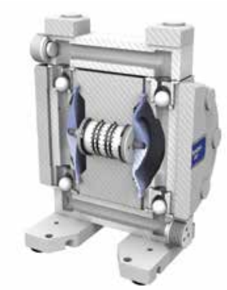
ChemSafe Models: 205, 307