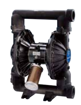
Husky 2150 2 in (50.8 mm) connection Max flow: 150 gpm (568 lpm) Polypropylene, PVDF, aluminum, stainless steel, iron