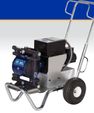
Husky 1050e Cart Mount 1 in (25.4 mm) connection Max flow: 50 gpm (189 lpm)