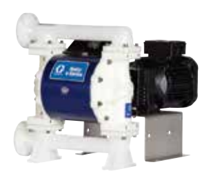
Husky 1050e Polypropylene 1 in (25.4 mm) connection Max flow: 50 gpm (189 lpm)