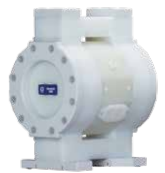
ChemSafe1590 1-1/2 in (38.1 mm) 99.5 gpm (376 lpm)