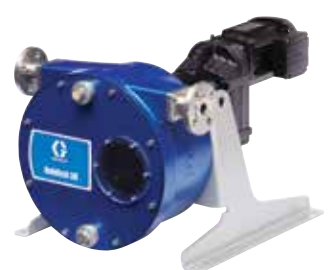
SoloTech 30 Max flow rate of 16 gpm (60.5 lpm). Typically used for abrasive material transfer applications