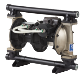
Husky 1050HP 1 in (25.4 mm) connection Max flow: 50 gpm (189 lpm) Aluminum and stainless steel