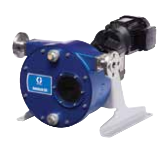
SoloTech 26 Max flow rate of 10 gpm (37.8 lpm). Typically used for abrasive material transfer applications.